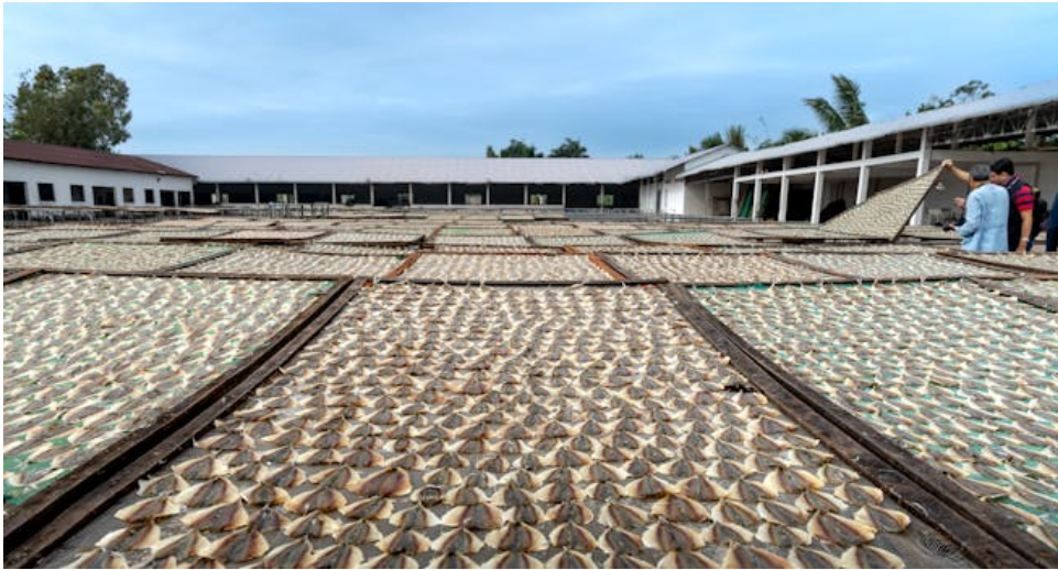
Figure 2: A sustainable pasta production facility showcasing eco-friendly practices.