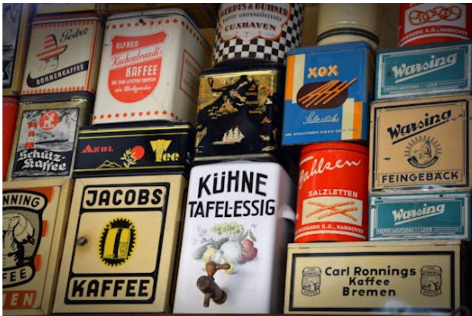
Figure 3: Biodegradable packaging options for pasta products.